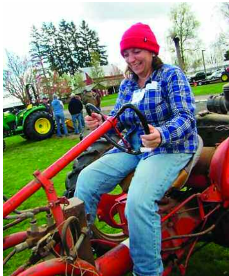
The recent adult tractor training class attracted participants from around the valley. There just isn't a place for hands-on training on farm equipment like NWREC provides.