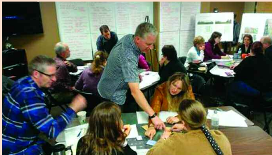
Clackamas Extension faculty and staff at a recent meeting with architects planning a new Extension Education Center in Oregon City.

struction on their Red Soils county government office campus. This would be the first time Extension would be housed in a building designed for their specific needs in their 98 year history in the county.